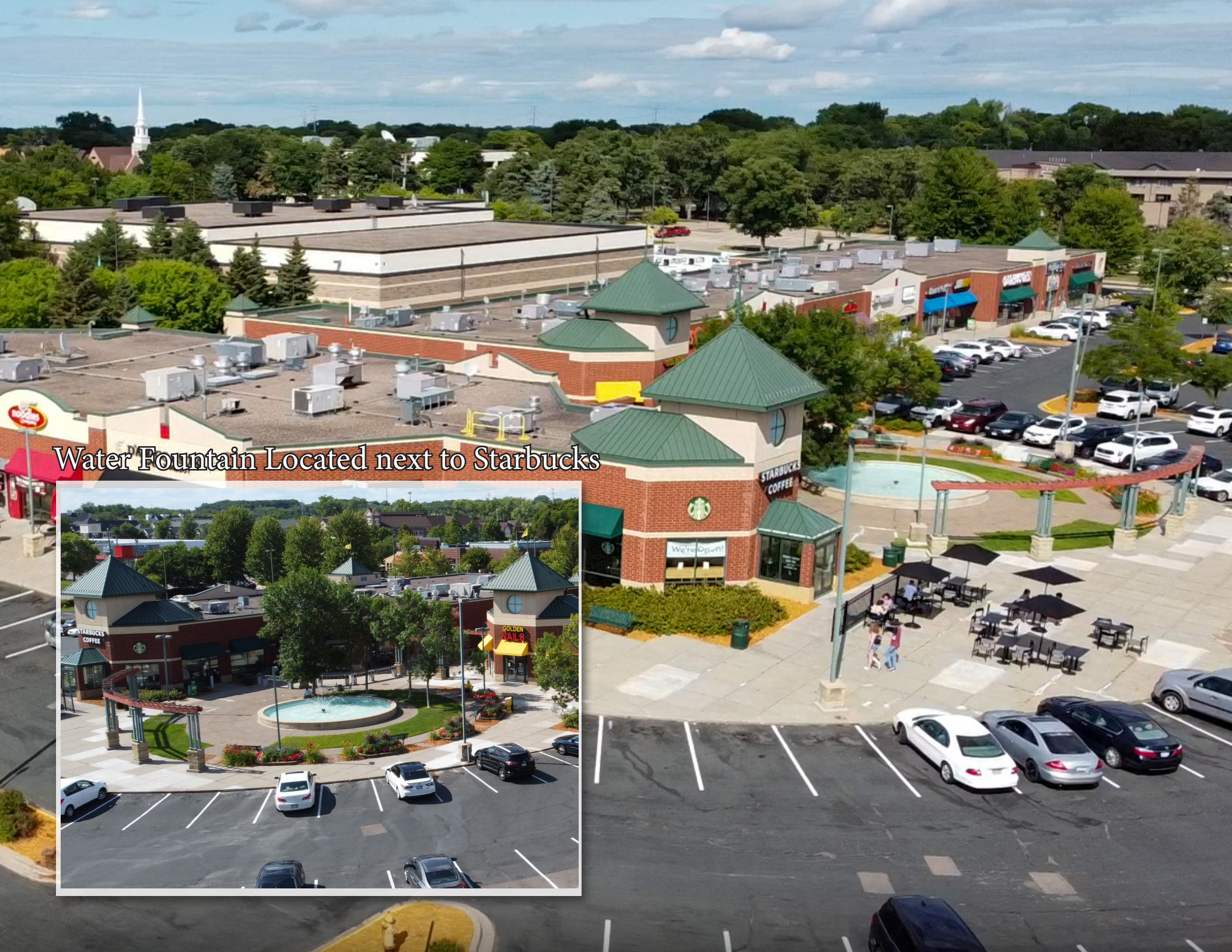
Water Fountain Located next to Starbucks