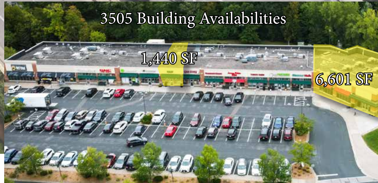
3505 Building Availabilities