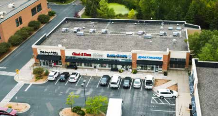
3525 Building - Fully Leased