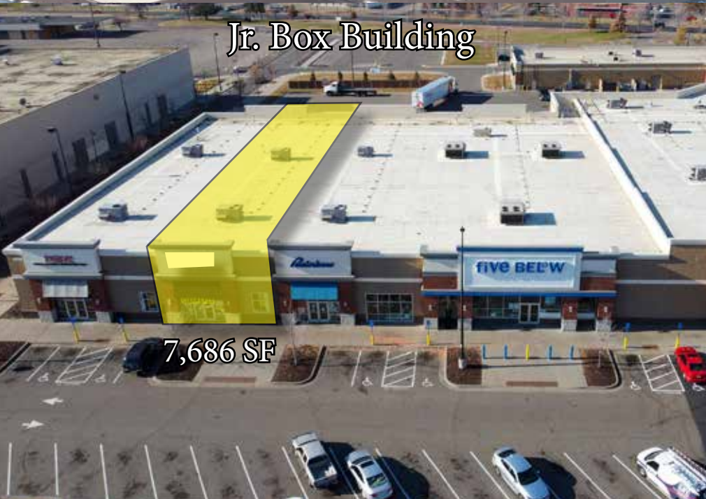
Jr. Box Building

2,989 SF Divisible to: 1,563 SF & 1,425 SF