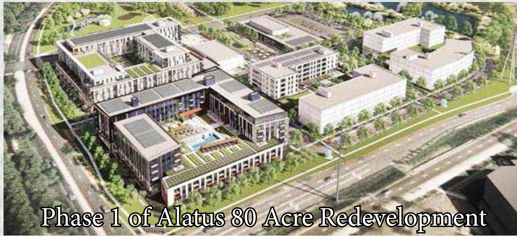
Phase 1 of Alatus 80 Acre Redevelopment