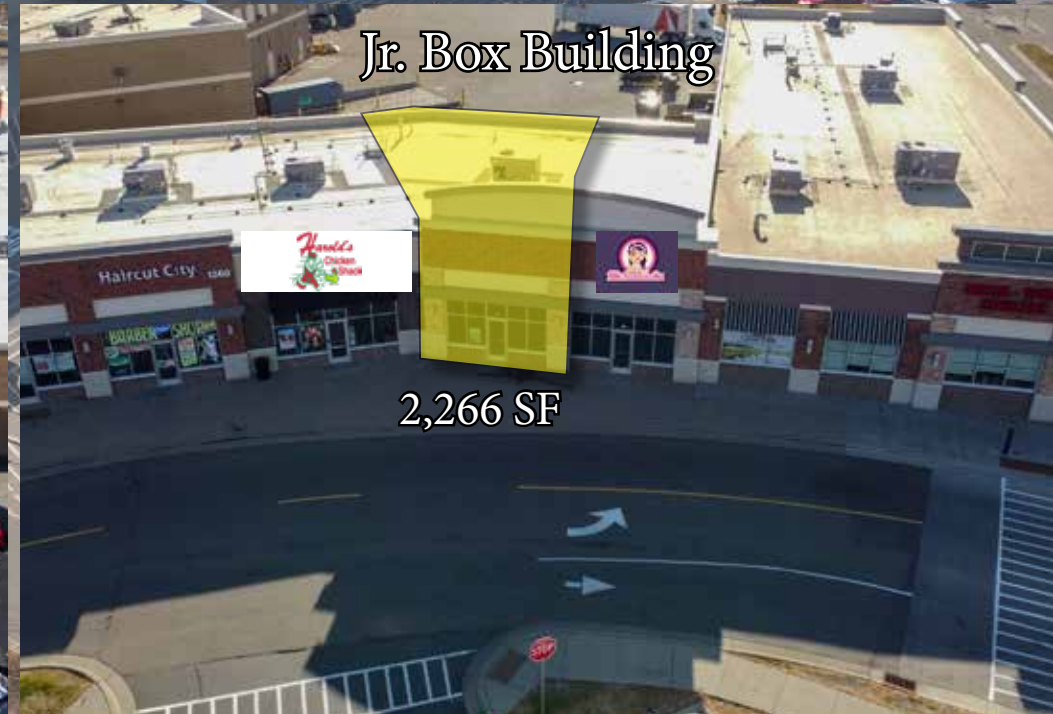
Jr. Box Building